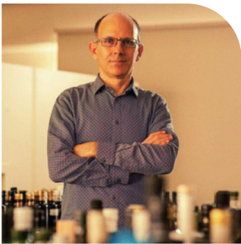
Manolis Salivaras Multichrom Lab