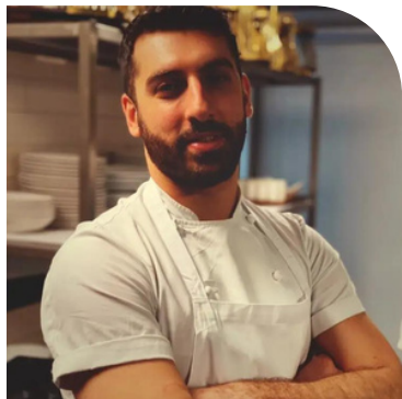
Valentino Rossi GORDON RAMSAY RESTAURANTS